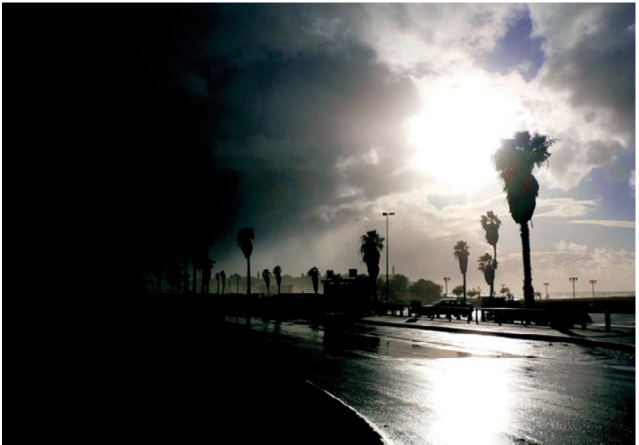
ANAMORPHÉE - PRINT